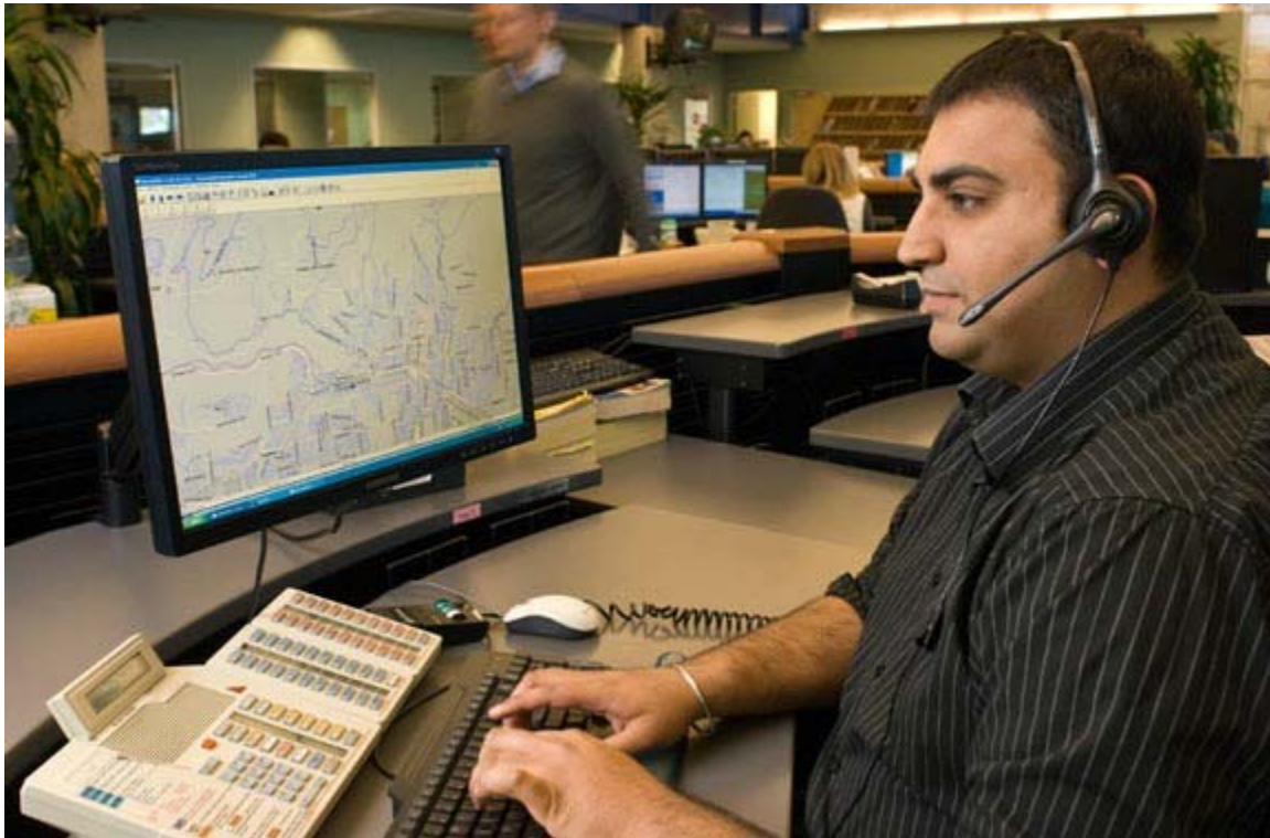
E-Comm 9-1-1 call taker

February 19, 2012. 8:22 pm • Section: Digital Life