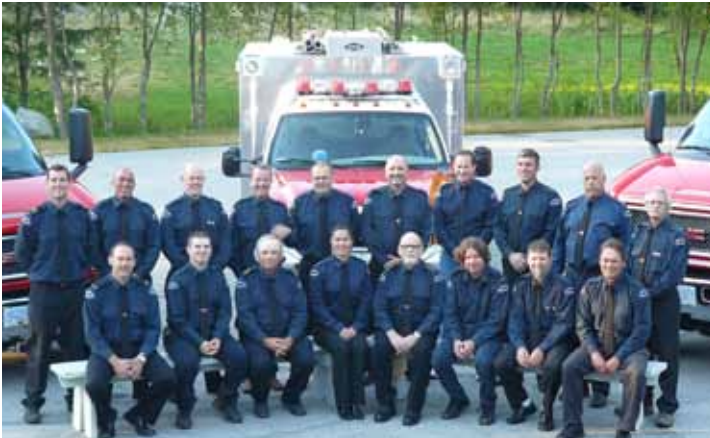
Halfmoon Bay was one of four fire departments on the Sunshine Coast to transition to E-Comm's Project FIRES records management system in October.

Now that four fire departments within the Sunshine Coast Regional District (SCRD) have joined Project FIRES electronic records management system, they will benefit from coordinated training on using the system, shared costs, and improved performance measures.