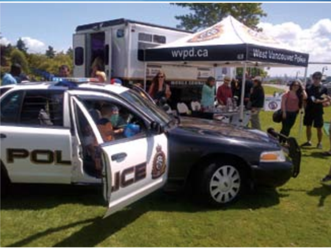
E-Comm celebrated West Vancouver's Community Day on June 7 with first responder partners.