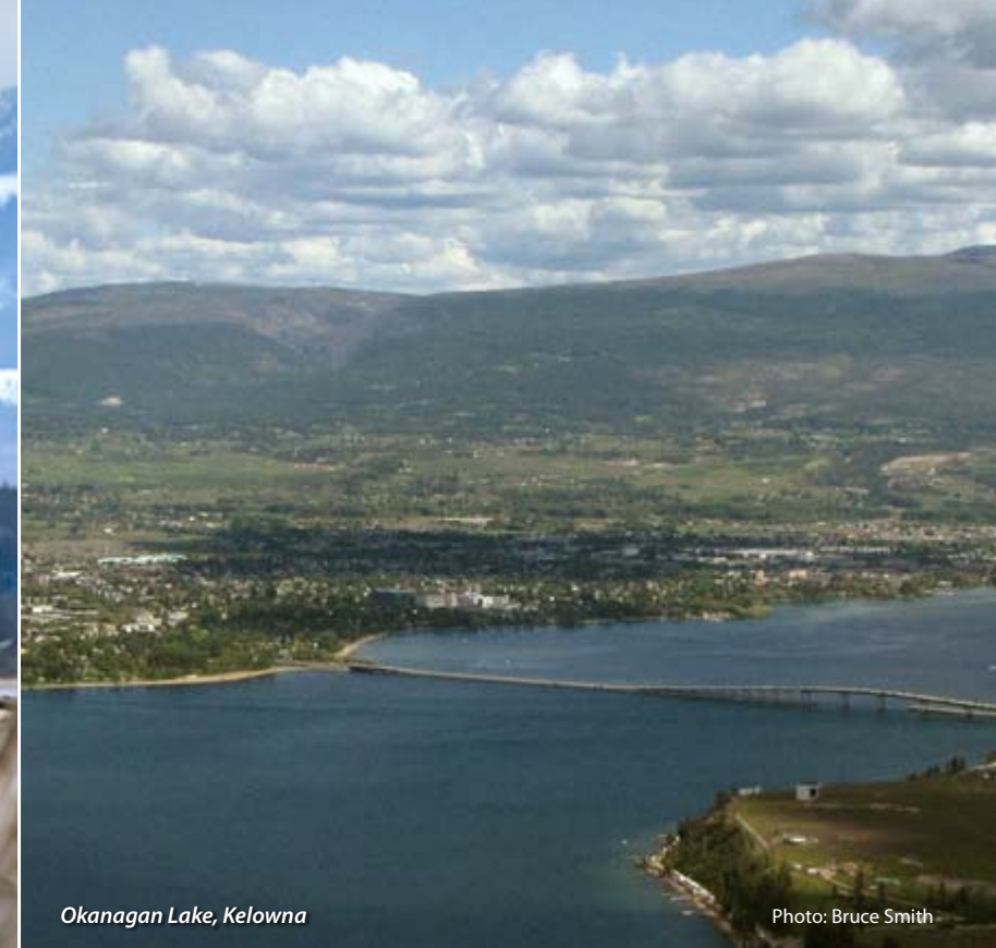
Okanagan Lake, Kelowna