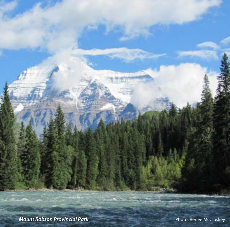
Mount Robson Provincial Park