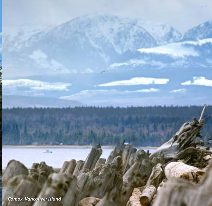
Comox, Vancouver Island