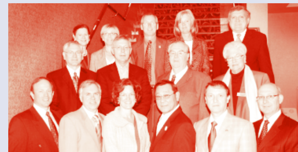
E-Comm's 2007-08 Board of Directors at their first board meeting of the year.